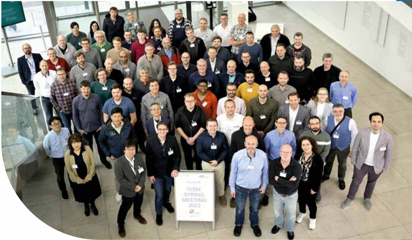
Vision Standards Meeting 2023