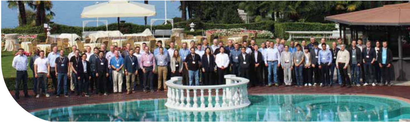
Vision Standards Meeting 2019